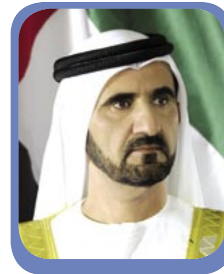
H.H. Sheikh Mohammed Bin Rashid Al Maktoum Vice President and Prime Minister of the UAE and Ruler of Dubai