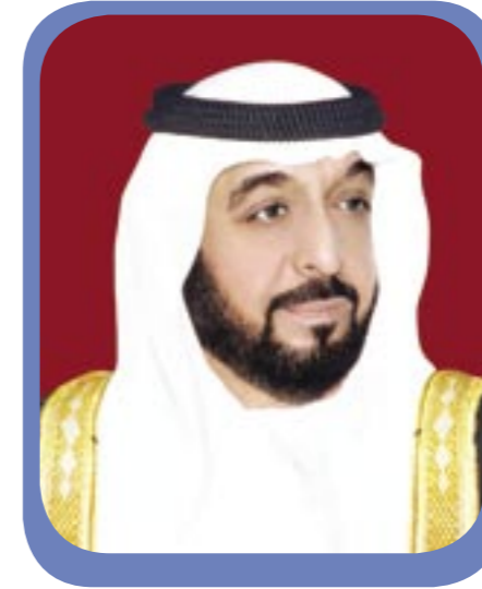
H.H. Sheikh Khalifa Bin Zayed Al Nahyan President of the UAE and Ruler of Abu Dhabi