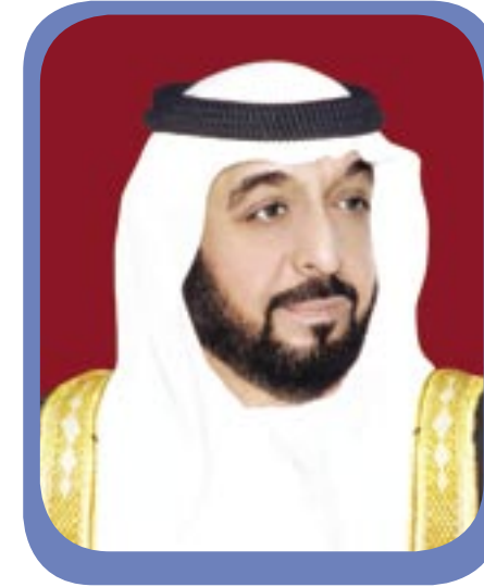
H.H. Sheikh Khalifa Bin Zayed Al Nahyan President of the UAE and Ruler of Abu Dhabi