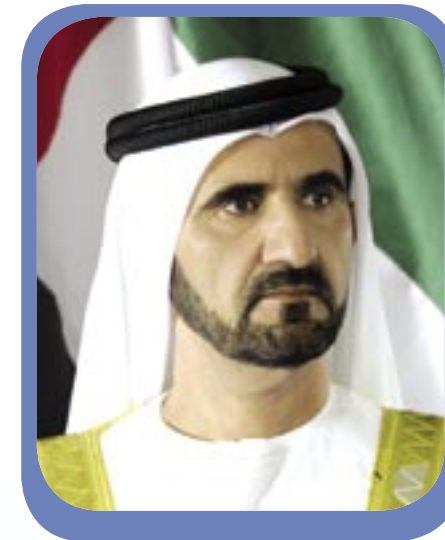
H.H. Sheikh Mohammed Bin Rashid Al Maktoum Vice President and Prime Minister of the UAE and Ruler of Dubai